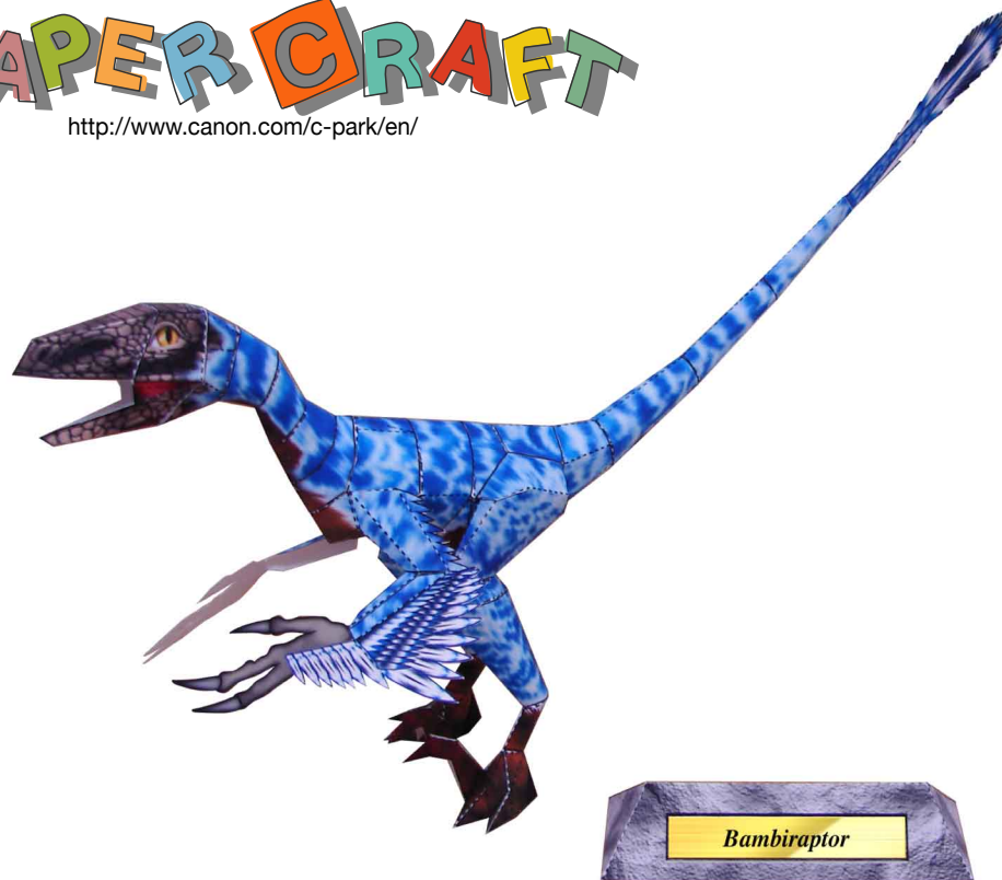
View of completed model

Total length : 90 cm ; weight : approx. 3 kg ; taxonomy : order Saurischia, suborder Theropoda, family Dromaeosauridae Period : Early Cretaceous period (approximately 80 million years ago) ; habitat : the Americas