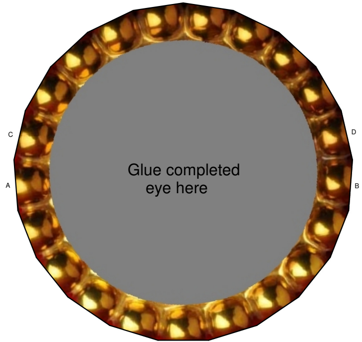
TOP OF EYE BASE