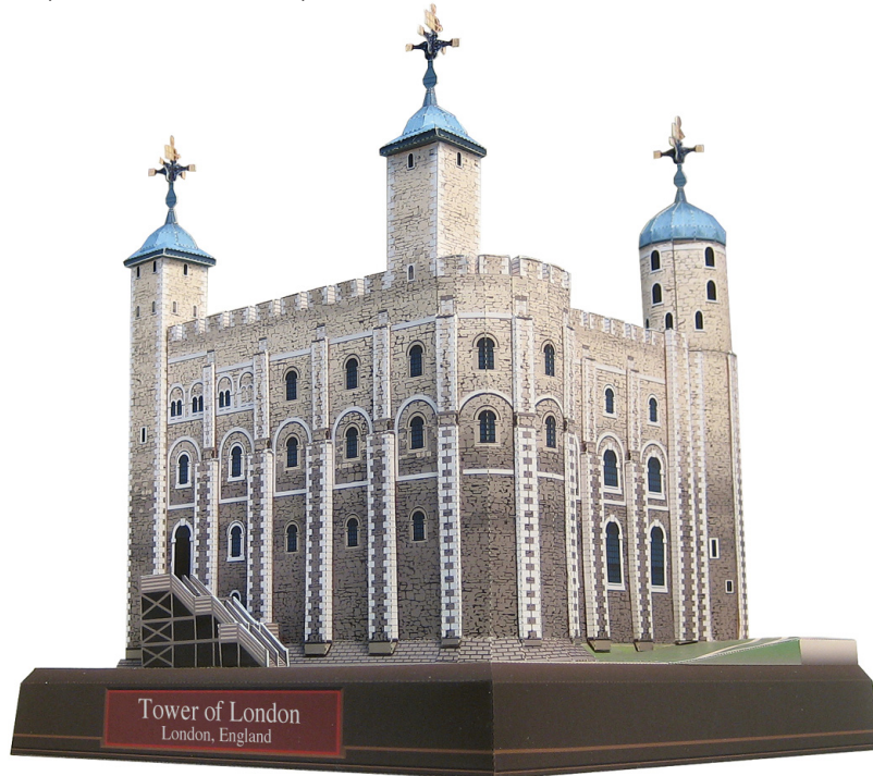
View of completed model